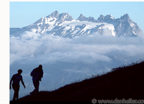
Strength For The Journey.

In this module we introduce you to the art of communication and teach you about the 5 levels of communication, communication traps, and defensive stances in communication. We introduce you to a 3 stage counselling model which teaches you: 1. To Explore the world of a client. 2 How to offer insight and understanding. 3. To help the client move on and move forward in a positive way.