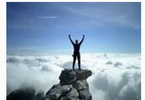
Flourishing and Thriving.