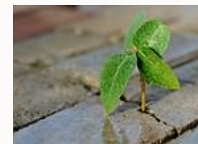
Post- traumatic growth! Tri- dimensional healing.

With broken hearts and negative emotions disempowering many people, this module will examine the root of negative emotions. God has created us with amazing potential and resilience. Spiritual truths will give insights and keys to healing the broken heart. We will open up closed areas of your life and help you to find the turning points to transformation which will be a experiences as a movement of grace.