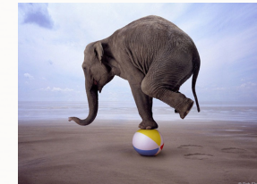
Work life Balance and Balancing energy for tasks.

Understanding of some important spiritual /psychological boundaries and how boundaries can be too rigid or too diffuse. The ability to move people from their valleys to a new place of hope will be taught and counselling skills of valley mapping, reflection, paraphrasing, active listening all taught through live demos & case work work .